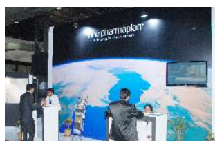
NNE Pharmaplan India Ltd.