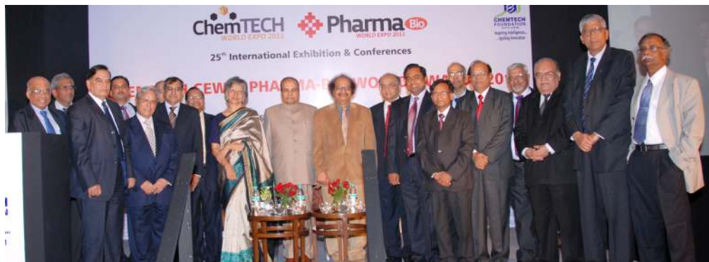
Best of the Best : Awardees of the Chemtech + Pharma-Bio Awards 2011