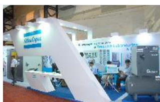
Atlas Copco (India) Ltd.