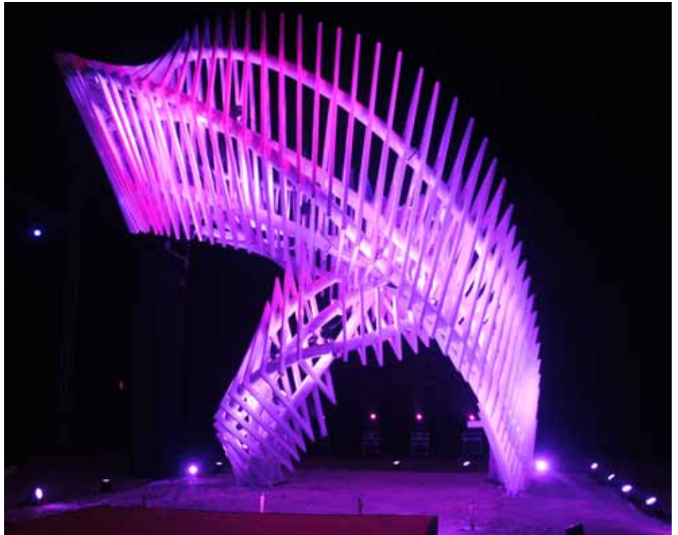
The Charkha was inaugurated at Cross Maidan on 2 nd October 2011.