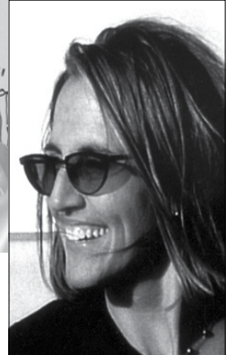
Alejandro Aravena, Principal, ELEMENTAL, Chile