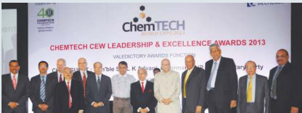
Best of the Best : Awardees of the Chemtech CEW Awards 2013