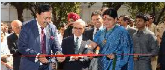
Smt Deepa Dasmunshi, Minister of State for Urban Development, Government of India and Mr Sudhir Vasudeva, CMD, ONGC inaugurate the opening of the Chemtech + EPC World Expo 2013 Conferences.