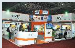
HRS Process Systems Pvt Ltd